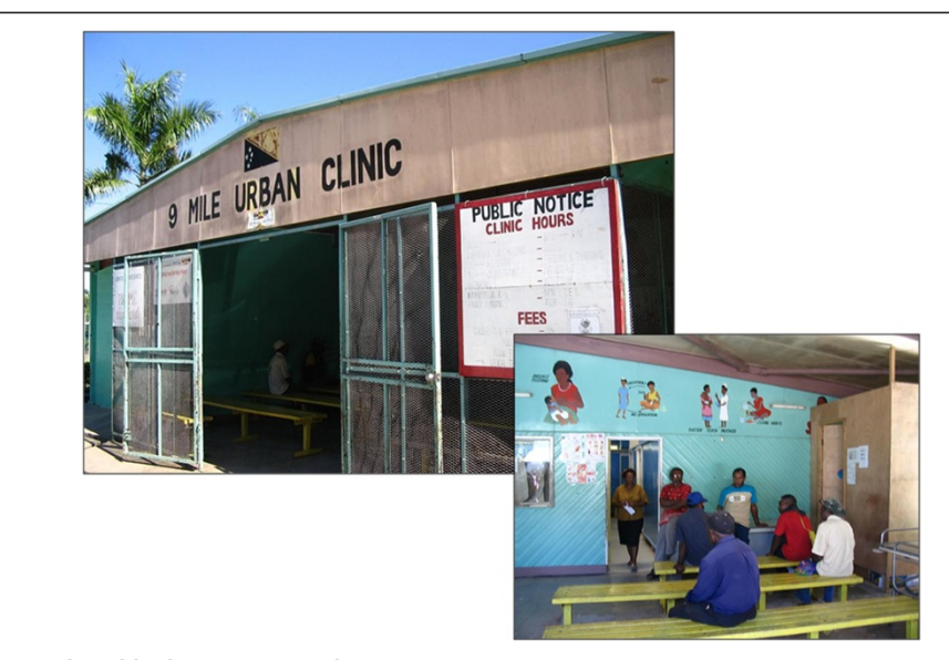
Figure 1 Nine-Mile Sexual Health Clinic, Port Moresby, PNG.

asked to comment on practices they had heard other women in the community were conducting and to indicate these using the template. Men were asked whether they were aware of their sexual partners conducting such practices or if they had heard about other women in the community conducting such practices, and to use the template to indicate these. Participants indicated IVP using marker pens, highlighter pens, biro and/or pencils provided by the study team and if literate, were asked to write the names of anatomical structures onto the sheet. Where participants were unable to read or write, interviewers wrote down participant's comments / anatomical names on the sheet on their behalf, using English and/or tok pisin depending on the language used by individual participants.