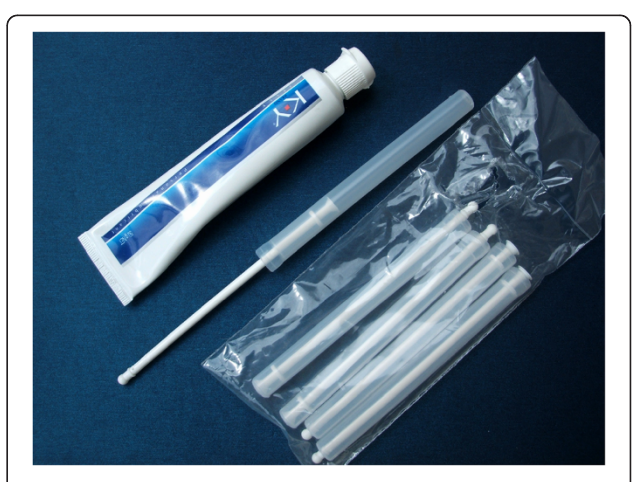
Figure 2 Products used to make 'dummy' microbicide gel and applicator.

Interviewer: 'Now I'd like to talk to you about new methods of protection being developed. We hope that women will be able to use these to protect themselves against HIV and sexually transmitted infections in future. These products are known as 'vaginal microbicides' and will probably be available in the form of vaginal gels or creams. We hope that an effective microbicide will become available in the next 3–5 years. I have here an example of what a vaginal microbicide gel might look like (Hold up pre-loaded dummy applicator). In future, women could insert a gel like this into the vagina, either daily or just before each sex act, to protect them against HIV and