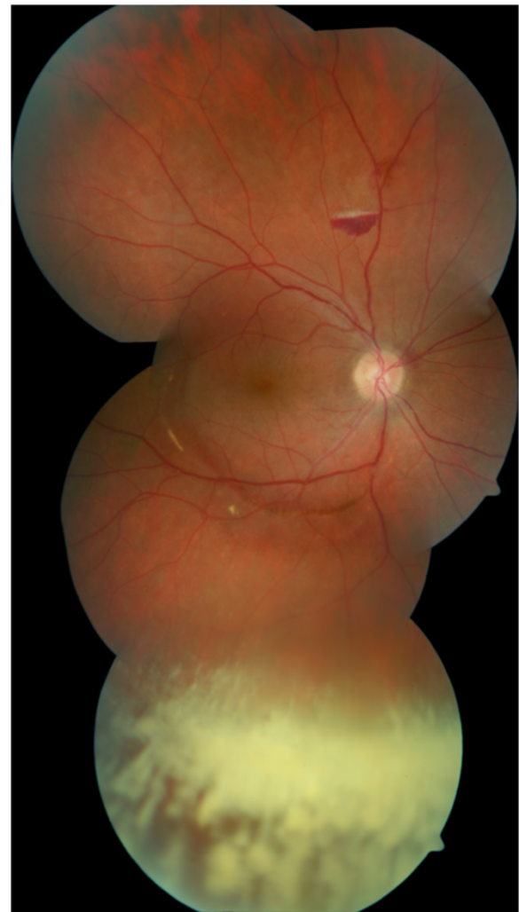
Figure 3 Right eye fundus image 3 months after initial presentation. Complete resorption of central retinal hemorrhages and remnants of vitreous hemorrhage inferiorly.

This case report demonstrates that massive retinal and preretinal hemorrhages in Wegener's granulomatosis can resolve under immunosuppressive therapy. Despite the lack of acute signs of vasculitis, particularly fluorescein extravasation in angiography, severe vasculitis-like retinal