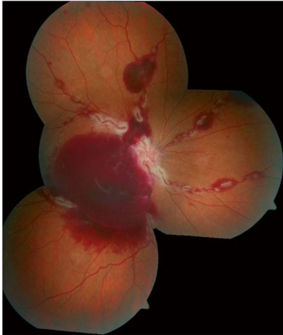
Figure 1 Right eye fundus image at first presentation. Dilatation of retinal veins, retinal and preretinal retrohyaloidal hemorrhages and segmental perivascular changes.

segment showed a hyperemia of the conjunctiva, while fundus examination was unremarkable.