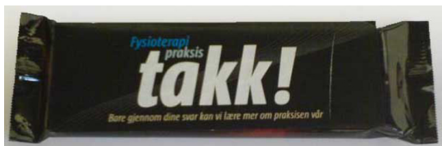
Figure 1 Bar of chocolate with sticker.

The proportion of completed data-collection forms (response rate) was the primary outcome.