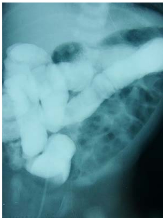
Figure 3 A barium enema shows malpositioning of the intestine.

remained asymptomatic, and laboratory analyses showed no elevation of white cell count or CRP, and no eosinophilia in the blood or stool. In addition, the patient showed good weight gain and no symptoms with increased cow's milk intake after discharge. Therefore, we concluded that this case was not the result of a CMA.