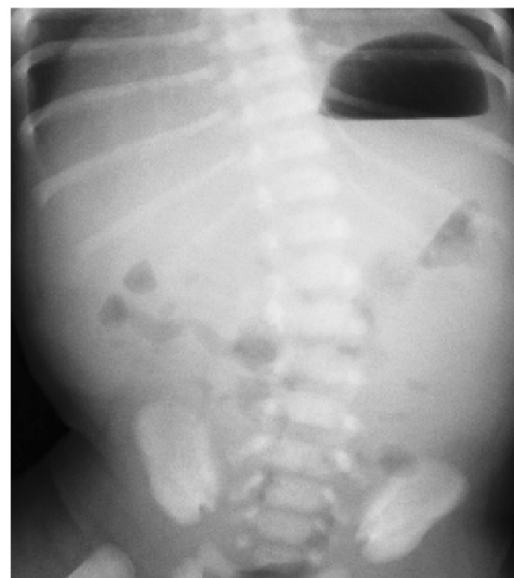
Figure 1 A plain abdominal radiograph shows a paucity of gas in the distal bowel.

Because the patient's lymphocyte response to kappa-casein was markedly increased (10,612 cpm; stimulation index 10), we suspected that he had a CMA, and the patient was re-started on breast milk alone 2 days post-surgery. Thereafter, the patient showed symptom-free normal progress with good weight gain.