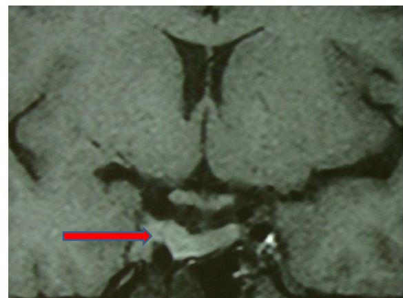
Figure 2 Repeat MRI (T1 weighted image) in the second trimester during pregnancy was done in order to assess the tumor size. It demonstrates considerable reduction in the tumor size, pituitary mass now being 1.8 \times 1.0 \text{ cm} (marked with a red arrow) as compared to the previous MRI shown in Figure 1.