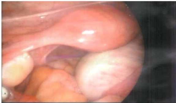
Figure 2 Laparoscopic finding shows an enlarged right ovary.

test, and pelvic ultrasound examination [3]. Currently, GnRH-stimulation test is considered the gold standard for correctly diagnosing children with precocious puberty [7]. Gonadotropin-dependent and gonadotropin-independent precocious puberty can be distinguished by differences in the responses to GnRH-stimulation testing, as GnRH-stimulated luteinising hormone (LH) and follicle stimulating hormone (FSH) concentrations are suppressed in pseudoprecocious puberty, but increased in central precocious puberty [8]. Ultrasonography is also a valuable diagnostic tool for evaluating sexual precocity caused by primary ovarian cysts [9]. In the patient presented here, GnRH-stimulation test results were compatible with pseudoprecocious puberty and pelvic ultrasound examination revealed a unilateral large ovarian cyst. Magnetic resonance study showed no adrenal mass. The source of sex hormones was then localized to autonomous estradiol production from ovarian cyst. With these findings, diagnosis of the autonomous functional ovarian follicular cyst was able to be made.