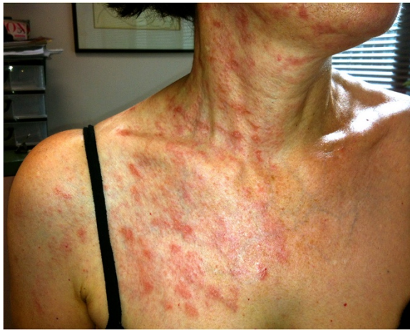
Figure 1 The sharp midline delineation of the patient's rash on day 24.

was diagnosed. Valacyclovir was extended to 10 days and prednisone started. A neuro-ophthalmology referral was made. On day 46, the patient returned showing significant improvement. She could smile symmetrically and close her right eye completely.