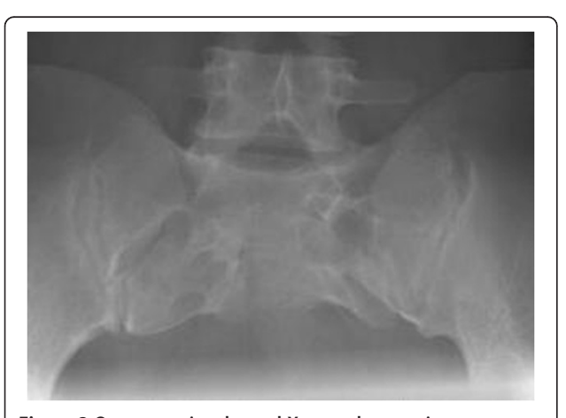
Figure 2 On conventional sacral X-ray a dysgenetic sacrum was seen.

Blood tests showed no abnormalities; particularly alpha foeto-protein and B-HCG were within normal ranges. MRI showed a large and previously not known anterior presacral meningocele (Figure 3) as well as a tethered cord due to a tight filum terminale (Figure 4). She refused testing for defects on the HLXB9 gene on chromosome 7q36. She was referred to a neurosurgeon and treatment of the meningocele consisted of a laminectomy S1-S2,