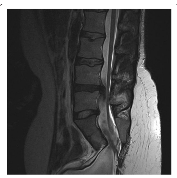
Figure 4 On the MRI image tethering of the spinal cord was seen at L5-S1 level. Additionally a herniation of an intervertebral disc is seen (asymptomatic and left untouched at surgery).