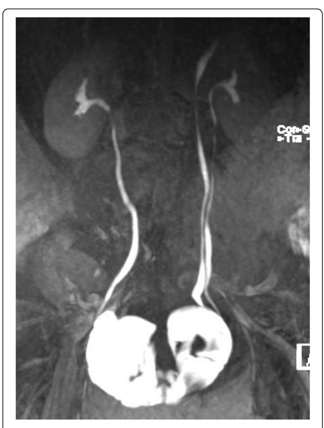
Figure 1 The MRI of our patient showed a double bladder with urinary output of both kidneys to the bladders.

Blood tests showed no abnormalities; particularly alpha foeto-protein and B-HCG were within normal ranges. MRI showed a large and previously not known anterior presacral meningocele (Figure 3) as well as a tethered cord due to a tight filum terminale (Figure 4). She refused testing for defects on the HLXB9 gene on chromosome 7q36. She was referred to a neurosurgeon and treatment of the meningocele consisted of a laminectomy S1-S2,