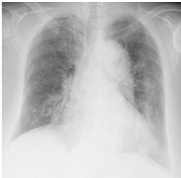
Figure 1 Chest X-ray obtained on admission showed consolidation in the left middle and lower lung fields.