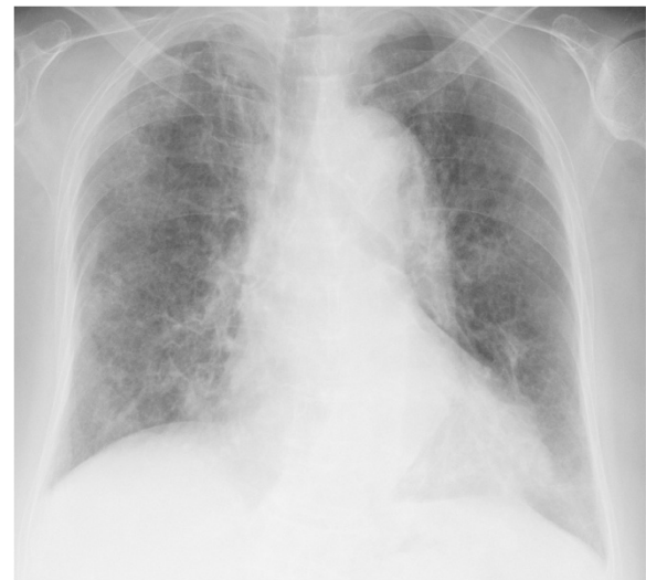
Figure 2 Chest X-ray obtained after the diagnosis of pneumocystis pneumonia showed areas of ground-glass opacity bilaterally in almost all lung fields.