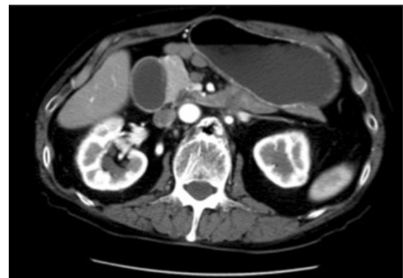
Figure 3 Obstruction in ileum due to seeding in duodenum.

At present, only palliative treatment is being administered as the patient has completed standard treatment.