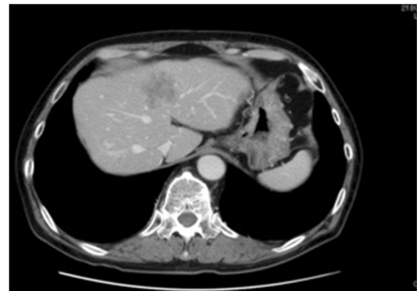
Figure 2 Response of liver metastases to CPT-11-cetuximab.

After 13 courses of chemotherapy with irinotecan and cetuximab (CPT-11 + C-mab), blood levels of CEA and CA19-9 dropped to 14.3 ng/mL and 16.8 U/mL, respectively, and liver metastases showed reduction, indicating partial response.