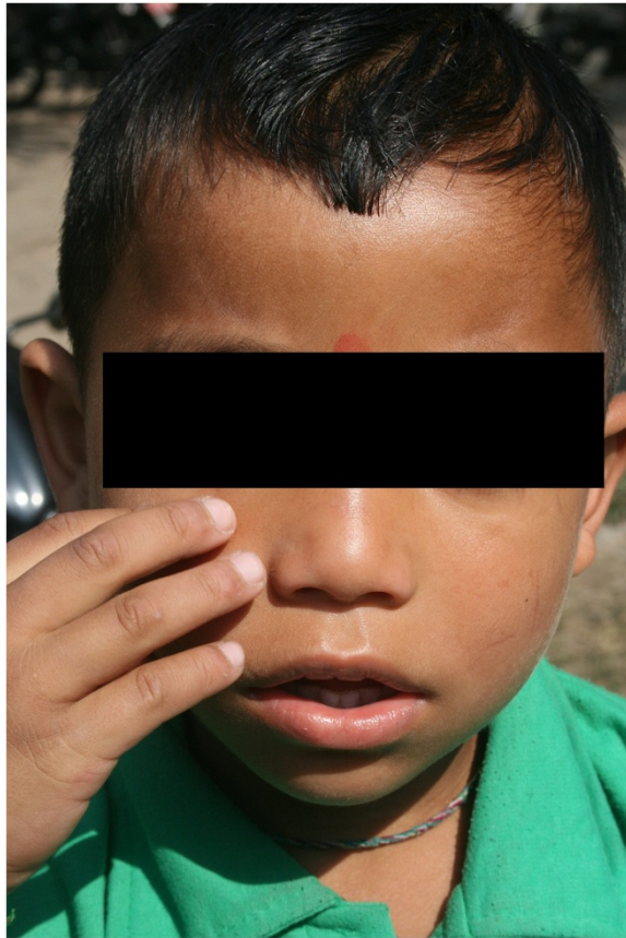
Figure 1 Picture showing the facial swelling and taut skin.