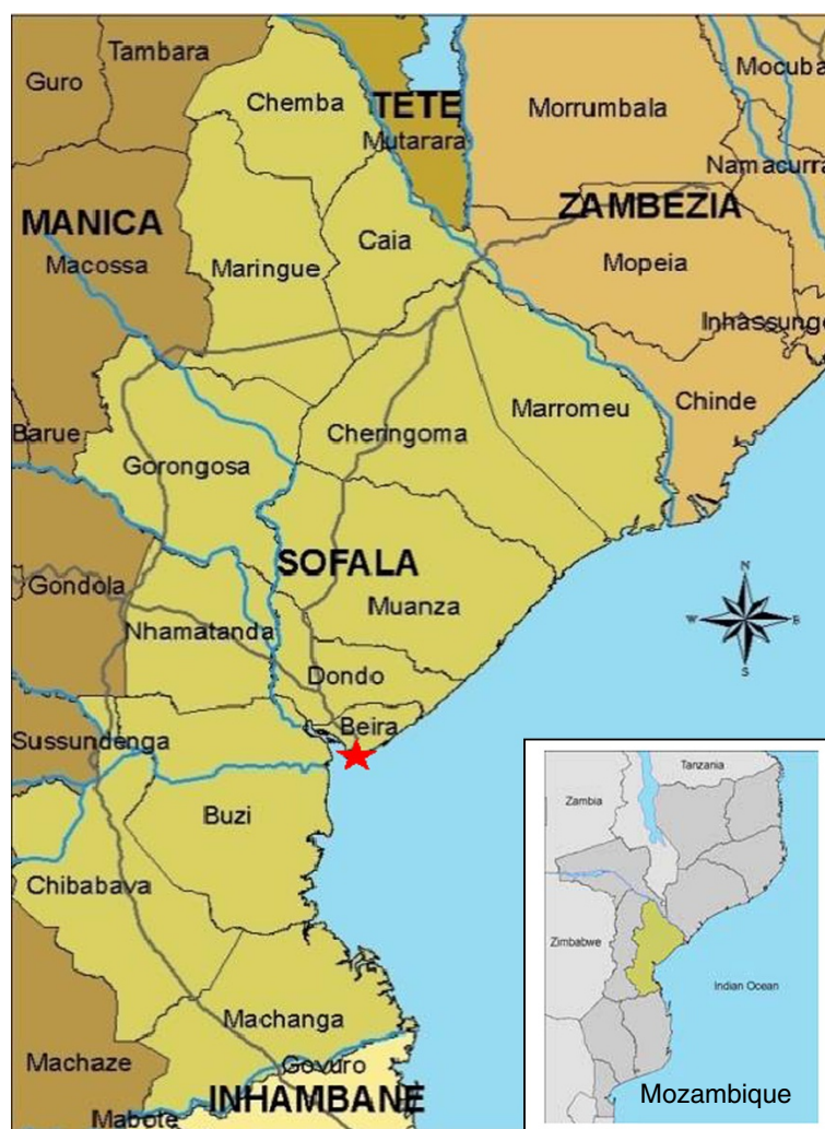
Figure 1 Map of Sofala Province, Mozambique.