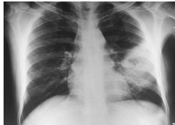
Fig. 1 Chest x-ray posterior–anterior view on admission (04/09/2014) showing homogenous opacity with a cavitary lesion occupying parts of left middle and lower zones

Sputum analysis revealed presence of plenty pus cells, gram negative bacteria on Gram's stain and growth of B. pseudomallei (Fig. 3) which was sensitive to augmentin,