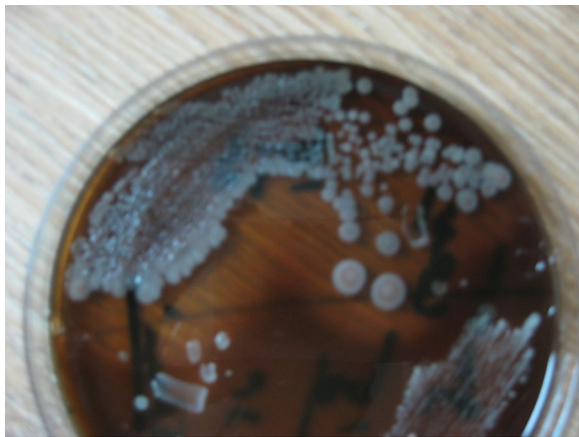
Fig. 3 Photograph showing growth of Burkholderia pseudomallei in Blood agar