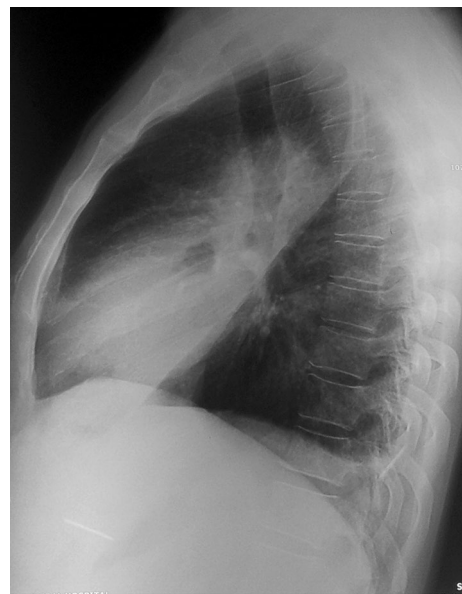
Fig. 2 Plain x-ray of chest, left lateral view (on admission)

aztroenam, cefixime, ceftriaxone, ceftazidime, cefotaxime, ciprofloxacin, co-trimoxazole, imipenem and piperacillin-tazobactam. Sputum polymerase chain reaction (PCR) for B. pseudomallei was also positive. Sputum for malignant cell, acid fast bacilli (2 samples), GeneXpert Mycobacterium tuberculosis/rifampicin (MTB/RIF) were not detected and Montoux test was negative. Blood and urine cultures revealed no growth. Tripple antigen, liver function tests, serum creatinine, lipid profile were normal.