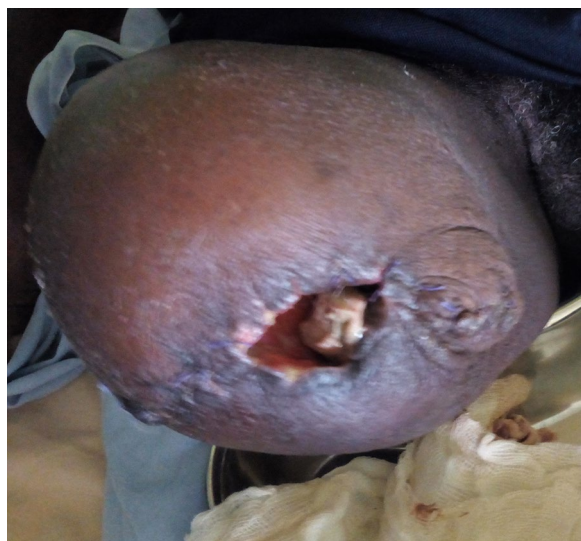
Fig. 5 Infected amputated stump by MDR Proteus mirabilis