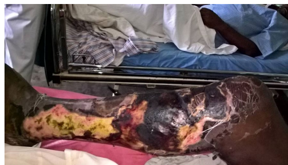
Fig. 1 Extensive necrotizing fasciitis of the right leg

Physical examination upon arrival at our centre revealed a temperature of 38.9 °c, respiratory rate of 23 breaths/min, blood pressure of 99/70 mmHg and a pulse rate of 114 beats/min. The patient was alert with pale conjunctivae and anicteric sclerae and his weight was 66 kg. His left leg was swollen, warm, fluctuant with ulcerated skin and necrosis to the level of the knee joint (Fig. 1). All digits of the right foot were pale and cold with absent posterior tibial pulse. The following investigations were conducted: a random blood glucose was 150 mg/dl (8.3 mmol/l) and a fasting blood glucose done 16 h later was 117 mg/dl (6.5 mmol/l). A complete blood count revealed a white cell count of 16.4 \times 10^9/l with neutrophil predominance, a microcytic hypochromic anaemia with haemoglobin level of 7.2 g/dl and platelet count of