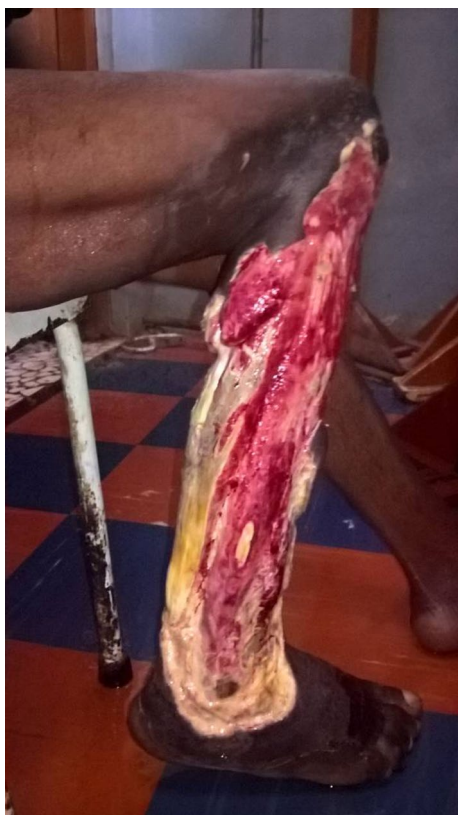
Fig. 3 Shameful exposure of the muscles of the leg after debridement

compatible whole blood were transfused during surgery. The patient continued having swinging pyrexia (Fig. 4) and on post-operative day 6, the stump started producing purulent discharges (Fig. 5). The second wound swab was collected and sent for culture and sensitivity and it still revealed P. mirabilis and E. coli were isolated. Proteus mirabilis was sensitive only to the carbapenems (imipenem and meropenem) while E. coli was additionally sensitive to ofloxacin and ornidazole (Table 1).