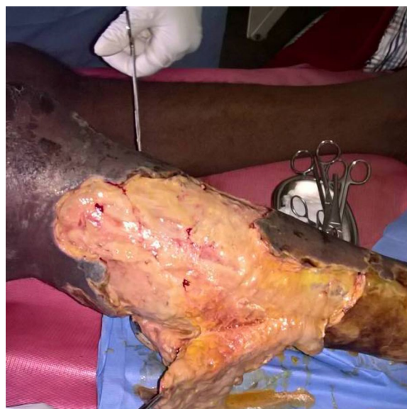
Fig. 2 Extensive tissue necrosis during debridement

The following parenteral antibiotics were given upon admission: ampicillin 1 g 6 hourly, gentamycin 80 mg 12 hourly and metronidazole 500 mg 8 hourly; analgesia included intravenous paracetamol 1 g 6 hourly and fluids. After counselling and consent, surgical debridement was done under general anesthesia 12 h following hospitalization. Visualization during surgical exploration confirmed the diagnosis of NF (Figs. 2 and 3). Debridement was repeated on day 3 and day 7 of hospitalization. After debridement, the wound was washed and dressed 12 hourly with Dakin's solution and normal saline. A wound swab was sent for culture and sensitivity and Proteus mirabilis and E. coli were isolated. Necrosis progressed despite multiple and aggressive surgical debridement resulting to an above-knee amputation. Two units of