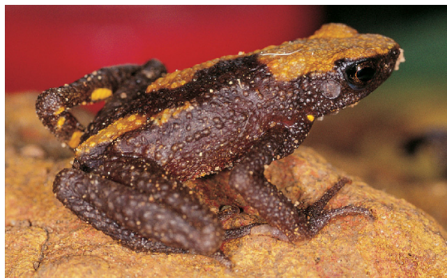
Figure 1 Ghatophryne ornata specimen SDB 6361, adult male, SVL 29.2 mm, collected from Kurichiyarmala, 11°35'N, 75°58'E, Wayanad, Kerala.

Ansonia ornata Günther, "1876" 1875, by original designation.