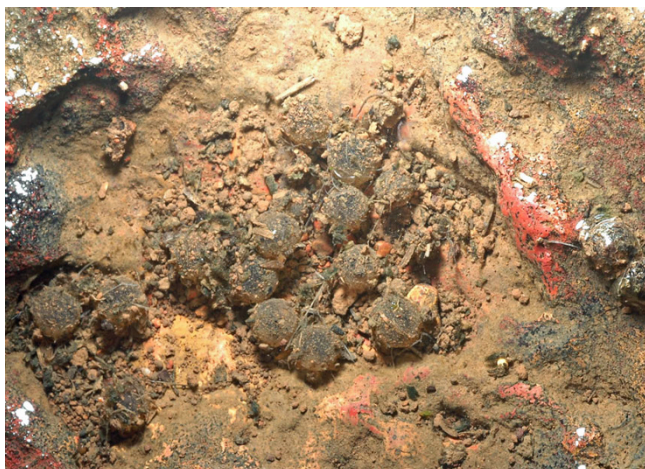
Figure 4 Xanthophryne tigrinus eggs are laid in clutches in temporary puddles.

Natural History Society. In this study, we examined the holotype and 18 paratypes (14 adult males - SVL 24.0-31.8 mm and 4 subadults - SVL 20.9-25.0 mm) deposited in BNHS and five paratypes in BMNH under the nomen ' Bufo sulphureus '. In addition, recent collections of ' Bufo ' koynayensis from the type locality were compared. All available material of this species is consistent with the original description.