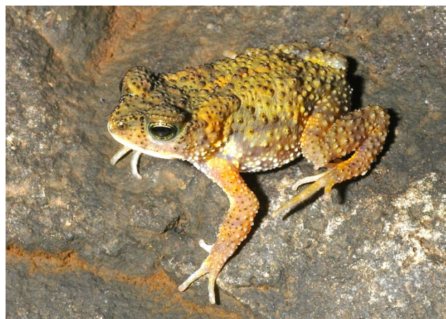
Figure 2 Xanthophryne koynayensis , a male adult (SDB 6040) from the type locality.

Holotype, BNHS 5175, an adult male, SVL 30.5, collected by SDB and VG on 23 August 2002 from Amboli, 15°56'N, 74°00'E, about 720 m asl, Sindhudurg, Maharashtra, India; paratypes, BNHS 5177, an adult male, BNHS 5176, an adult female, collected along with the hol-