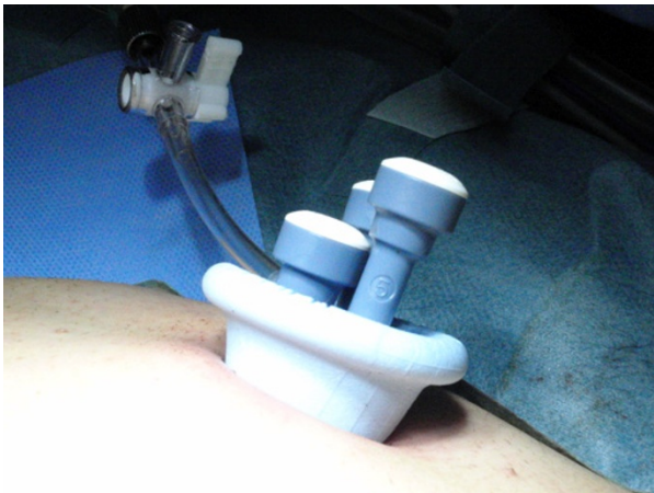
Figure 3 Intraoperative photograph of SILS port placed in umbilicus.