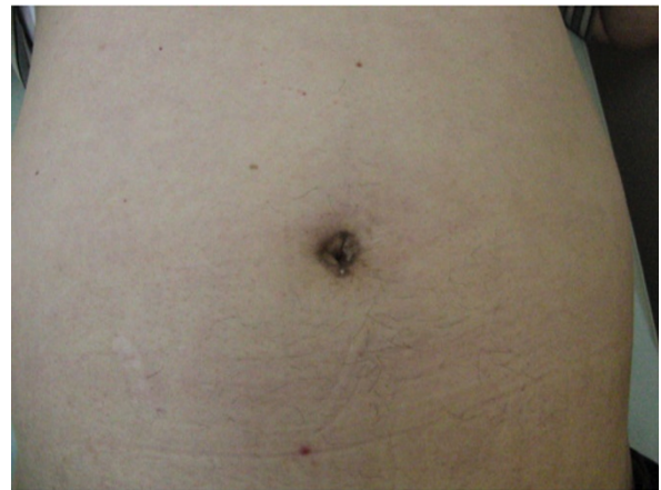
Figure 5 Postoperative photograph of skin incision of a patient who underwent right adrenalectomy.

can be traumatic for the liver. To avoid traumatic procedure, we used a small gauze or Securea sponge (Hogy, Tokyo) as cushioning to lift the liver (Figure 6). In all cases of LA, we placed 3 or 4 ports into the intraperitoneal space in an usual fashion, and performed adrenalectomy by using rigid straight laparoscopic instruments and a rigid laparoscope under pneumoperitoneum.