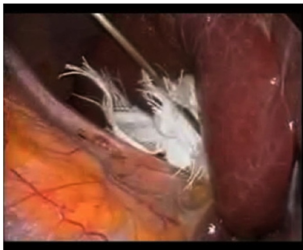
Figure 6 The liver is lifted using gauze and a miniport forceps. 4b Longer hook for Opti4 laparoscopic electrode.

The mean operative time was not significantly different for left side tumors ( 118.4 \pm 13.1 min, n = 5 ) and right side tumors ( 122.7 \pm 29.3 min, n = 7 ) in LESS-A while neither BMI nor tumor size was different between the two sides. In order to investigate the difference between LESS-A and conventional LA (18 male and 6 female; mean age: 55.9 \pm 2.0 ; BMI: 25.0 \pm 0.7 ; tumor size: 14.8 \pm 1.4 mm; n = 24 ), we statistically compared these two groups in terms of perioperative data (Table 2). Compared with LA ( 110.2 \pm 7.3 min), LESS-A appeared to require a longer operation time ( 121.2 \pm 7.8 min), although the difference was not statistically significant. In addition, there were no differences in blood loss (not detectable in both groups), analgesic requirement (flurbiprofen axetil 2.9 \pm 0.5 mg vs. 2.9 \pm 0.5 mg, p = 0.501 ), and length of stay ( 5.2 \pm 0.3 days vs. 6.1 \pm 1.0 days, p =