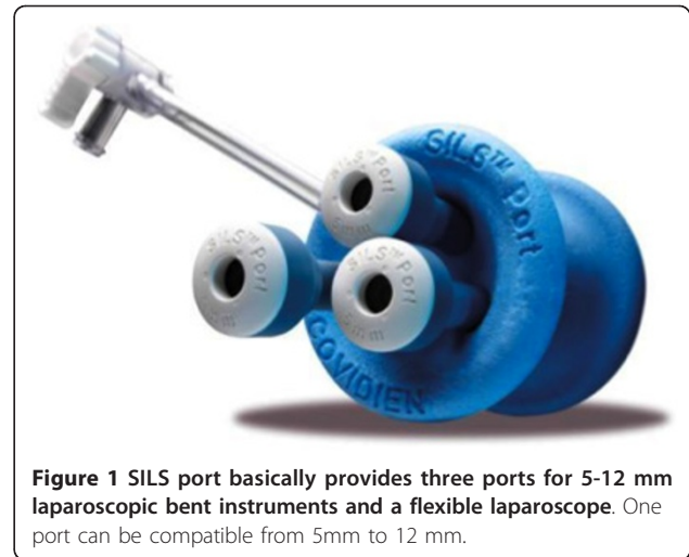
Figure 1 SILS port basically provides three ports for 5-12 mm laparoscopic bent instruments and a flexible laparoscope. One port can be compatible from 5mm to 12 mm.

The multichannel port (SILS port, Figure 1), bent laparoscopic instrument (Roticulator Endo Mini-Shears, Figure 2) and Opti4 laparoscopic electrodes were supplied by Covidien (Mansfield, USA). Ultrasonic scalpel (SonoSurg) was supplied by Olympus Surgical (Tokyo Japan). In all cases of LESS-A, we approached the intraperitoneal space through the umbilicus. The SILS port was placed through a 2 cm incision at the inner edge of the umbilicus (Figure 3). The anterior rectus fascia was sharply incised, and four corner fascial stay sutures were placed. A 5 mm flexible laparoscope (Olympus Surgical, Tokyo, Japan) was introduced to keep the laparoscope outside the port in a location away from the surgeon's instruments to avoid instrument contact and maximize surgical movement. Bent instruments were required to create the operative angle because the insertion points