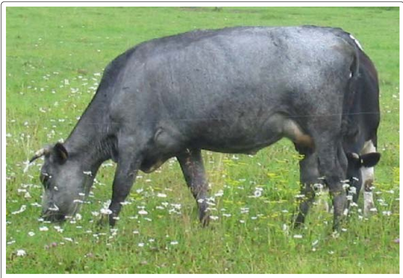
Figure 1 A grey cow from the Vahtramäe farm in Estonia.

Eleven Estonian grey cattle individuals from different stocks were blood-sampled. Particular efforts were made in all cases, using both the limited pedigree information (e.g. mostly only parent-offspring and full-sibling relationships) available and the knowledge of local herdsmen (e.g. the farm or village where the cattle originate from and the previous owners) via the interview questionnaire, to ensure that the animals were unrelated and had characteristics typical of the