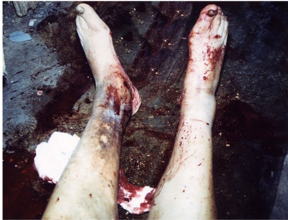
Figure 1 The scene of death. Victim's low extremities surrounded by high quantity of blood and blood-soaked tissues.

ulcer margin was covered by epidermis that abutted above, within or under the few fibrinous exudates. The underlying dermis contained numerous small and medium-sized blood vessels, filled with red blood and surrounded by thick organized fibrous cuffs. The remainder dermis presented fibrosis and abundant macrophages, as well as focally extravasated red blood cells and perivascular deposits of hemosiderin, a sign of repeated past dermal micro-hemorrhages (Figure 2B).