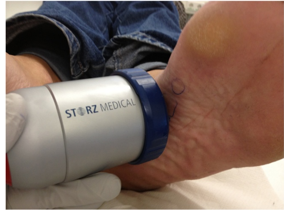
Figure 2 High-energy focused extracorporeal shockwave therapy (ESWT, Storz Duolith SD1) in plantar fibromatosis (Ledderhose's disease).

(ESWT), which was introduced from urologists in order to destroy kidney stones, has been tested in penile fibromatosis (Evidence level Ib) [5]. Another study reported that about half of all ESWT treated patients had a significant reduction in penile angulation [6]. Given these observations in penile fibromatosis, we started to perform a randomized-controlled trial to evaluate high-energy focussed ESWT in palmar fibromatosis, Dupuytren's contracture (DupuyShock) [7].