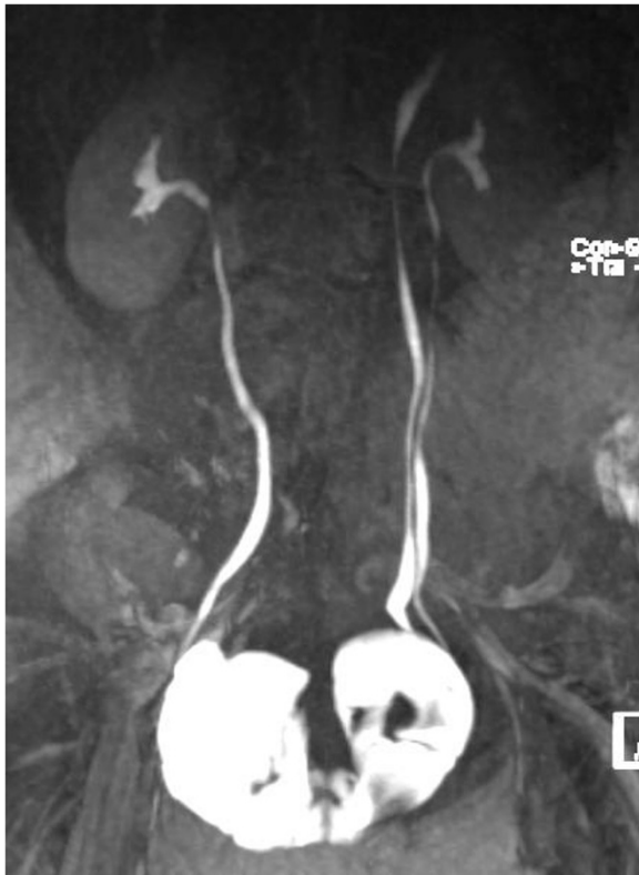
Figure 1 The MRI of our patient showed a double bladder with urinary output of both kidneys to the bladders.