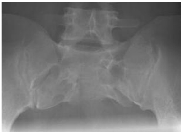
Figure 2 On conventional sacral X-ray a dysgenetic sacrum was seen.

Blood tests showed no abnormalities; particularly alpha foeto-protein and B-HCG were within normal ranges. MRI showed a large and previously not known anterior presacral meningocele (Figure 3) as well as a tethered cord due to a tight filum terminale (Figure 4). She refused testing for defects on the HLXB9 gene on chromosome 7q36. She was referred to a neurosurgeon and treatment of the meningocele consisted of a laminectomy S1-S2,