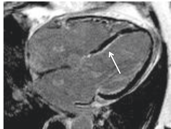
Figure 2 Magnetic resonance imaging with arrow depicting subendocardial delayed enhancement in the 4 chamber axial view.

infection and stool for ova and parasites as well as serology for trypanosome and strongyloides were negative. A vasculitis screen including anti-neutrophil cytoplasmic antibodies (ANCA) was negative. There were no recently started medications to suggest a drug induced hypersensitivity reactions and physical exam and history were negative for malignancy.