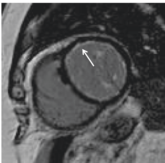
Figure 1 Magnetic resonance imaging with arrow depicting circumferential subendocardial delayed enhancement on the short axis view.

A 76-year-old Caucasian gentleman with a history of hypertension and asthma presents with history of sharp and pleuritic chest pain radiating to the shoulders with associated dyspnea with gradual deterioration of functional status to New York heart Association (NYHA) functional class III. Laboratory investigations revealed a normal creatine kinase (CK), elevated troponin T at 2.74 ug/L, C-reactive protein (CRP) at 140 mg/L (normal: 0–8), and eosinophilia at 3.92 \times 10^5/L . The initial presumptive diagnosis was acute coronary syndrome however coronary angiography revealed no significant coronary artery disease. The patient was found to have global reduction in left ventricular systolic function, ejection fraction (EF) 30–35%, along with mildly impaired right ventricular dysfunction on echocardiography. In addition, an uninfused computed tomography (CT) scan of the chest revealed a small right pleural effusion and multiple small centrilobar nodules in the lungs bilaterally with upper lung zone predominance and ground glass attenuation consistent with pulmonary eosinophilia. Magnetic resonance imaging (MRI) identified mild subendocardial delayed enhancement with a near circumferential distribution raising the possibility of eosinophilic myocarditis (Figures 1, 2). There were no suggestions of underlying