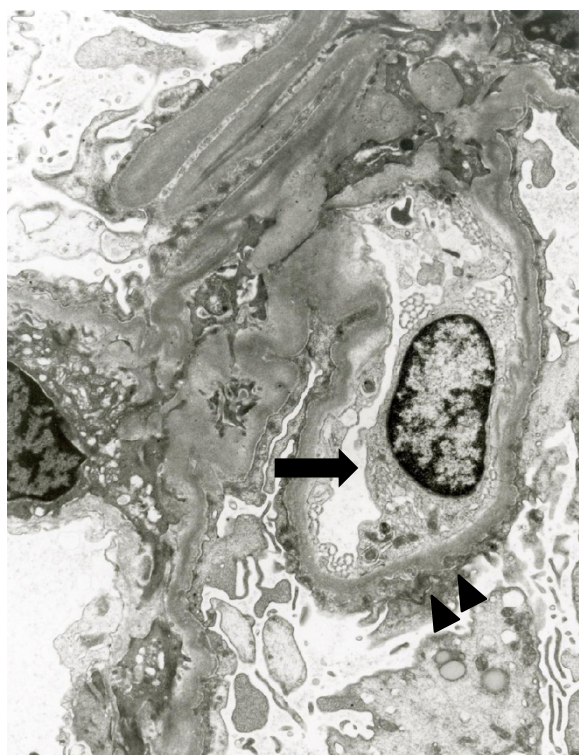
Figure 4 Electron microscopic analysis demonstrated the swelling of the endothelial cell (arrow), the damage of lamina rara layer and electron dense deposit at the subepithelium (arrow head). (Magnification: 8050X).

may be involved in the glomerular endothelial damage in another factor disorder [5]. There is a possibility that coagulopathies may be related to the occurrence of renal disorders with glomerular endothelial cell damages. In this patient, we observed dense subepithelial deposition and the detachment of endothelial cells in the glomerulus upon electron microscopic analysis. It may be suggested that the characteristic finding of membranous nephropathy with acquired factor inhibitors is the presence of damage of the glomerular endothelial cells and lamina rara layer, with high-density deposits at the subepithelium in the glomerulus. Frigui et al. reported that the eosinophils are associated with MN [6]. Renal disorders with eosinophils were caused by several diseases such as drugs, cholesterol embolization, immunoallergic responses et al. [7]. Giudicelli et al. described that most secondary renal disorders in hyperphils are usually due to an immuno-allergic process leading to deposit of immune complexes in glomeruli. Taken together, we reported that membranous nephropathy complicated with factor V inhibitor. The presence of FV inhibitors should be taken into consideration when patients are diagnosed with nephrotic syndrome and MN by renal biopsy because there is some possibility that the FV inhibitors can lead to serious bleeding complications.