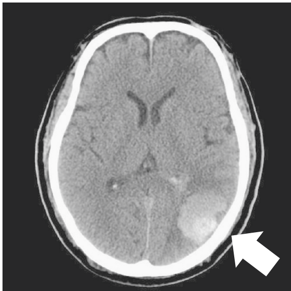
Figure 1 Left cerebral hemorrhage (arrow) image on computerized tomography.

Additional file 2: Figure S2). We determined that the patient had developed MN with glomerular endothelial cell damage. After the administration of steroid therapy, the proteinuria improved gradually.