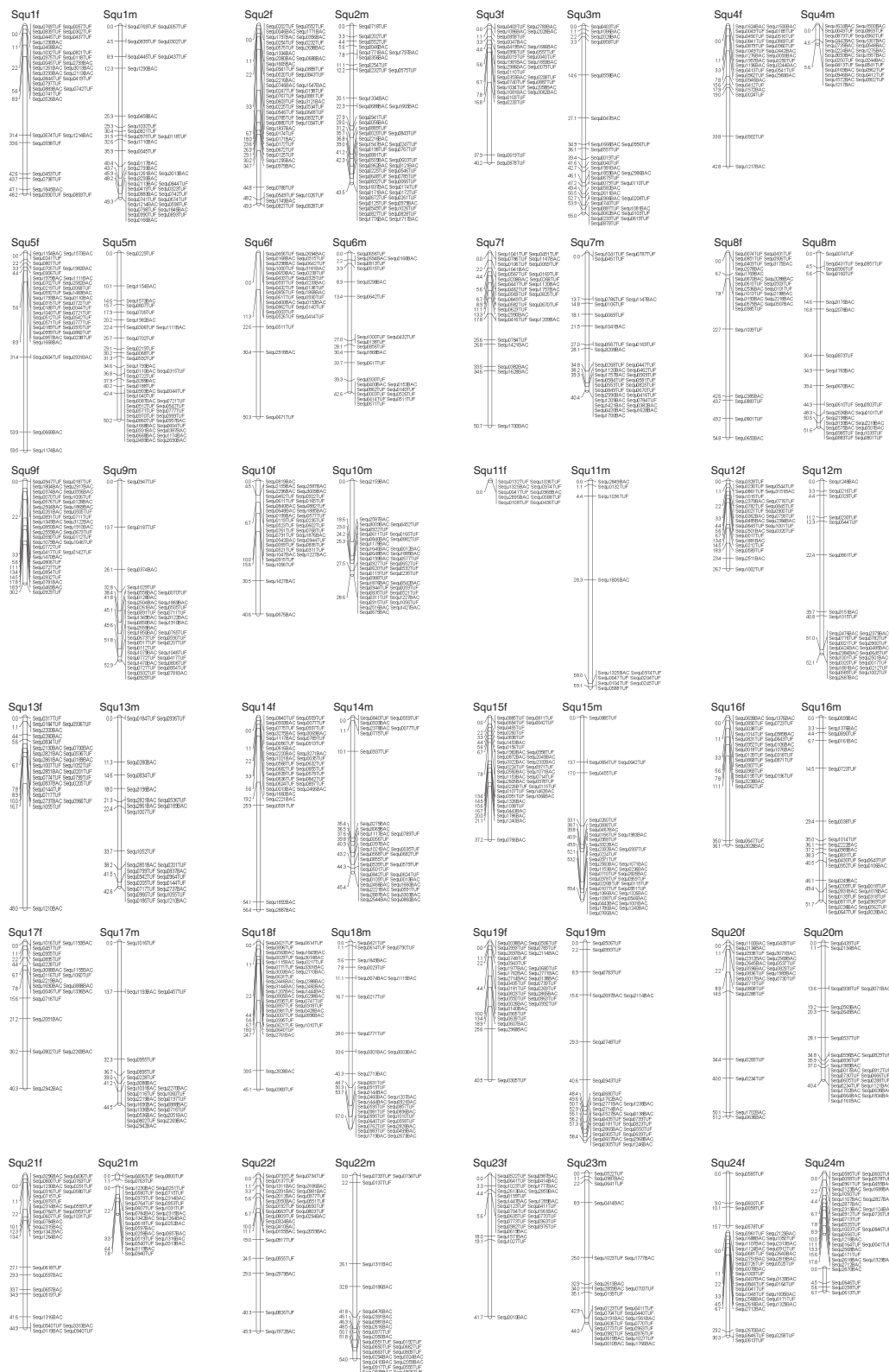
Figure 1 Yellowtail female (left) and male (right) maps for linkage groups Squ1- Squ24. Total lengths of linkage groups are expressed in Kosambi cM. BES-derived SSR markers are coded "BAC" after a number, and microsatellite markers developed from genomic library are coded "TUF".