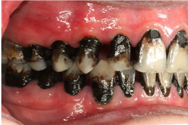
Figure 15 Left buccal view after SDF treatment.

noticeable. He was advised to brush his teeth twice daily with fluoride toothpaste, and continue using a interdental toothbrush after every meal.