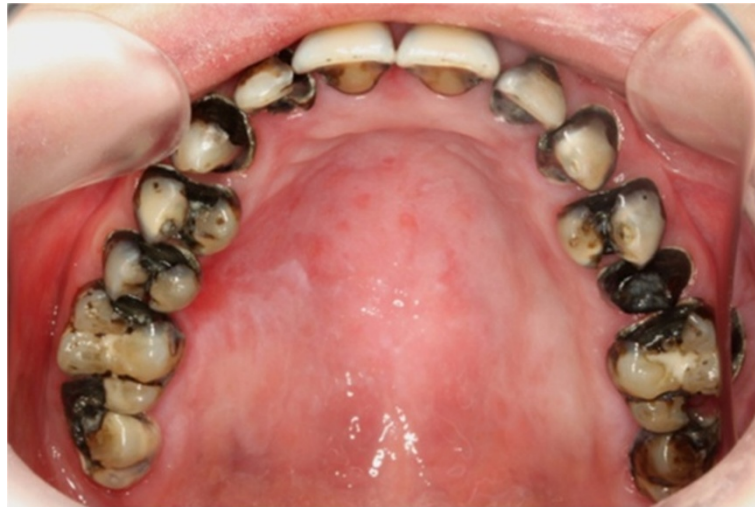
Figure 13 Upper occlusal view after SDF treatment.

toothpaste difficult to use because of its texture and mint favor. He was therefore advised to brush his teeth at least twice daily by dipping an extra-soft toothbrush with 0.01 mm slim-tip bristles (Slim Soft, Colgate Sanxiao Co., Yangzhou, China) into 0.06% w/v chlorhexidine digluconate and sodium fluoride (250 ppm fluoride) (Corsodyl Daily Defence Mouthwash, GlaxoSmithKline, Middlesex, UK). An interdental brush was used to clean the interproximal area between adjacent teeth. Three professional applications of SDF (Saforide 38%, Toyo Seiyaku Kasei, Japan) were performed after plaque removal by gentle brushing by the dentist. The second application was provided two weeks afterward; and the third application