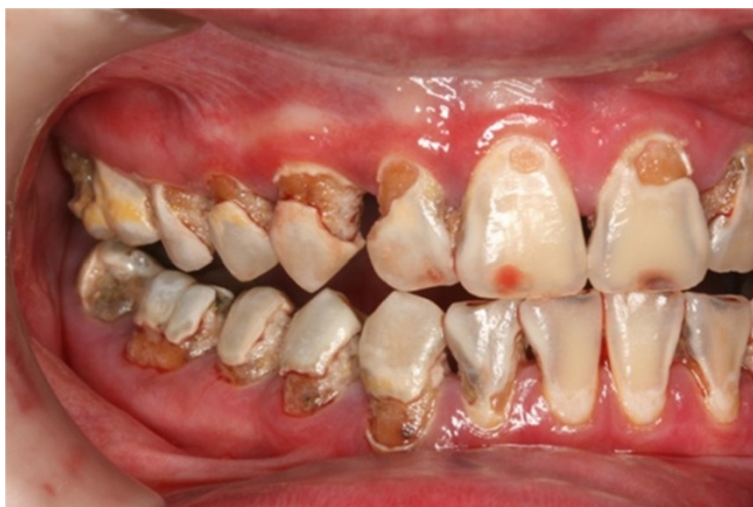
Figure 8 Pre-treatment left buccal view.

A 14-year-old Chinese boy suffering from major \beta -thalassemia was referred to the dental clinic for treatment of rampant dental caries (Figure 1). He has had regular blood transfusions and iron chelation therapy since he was young. He underwent a matched, unrelated-donor bone-marrow transplant with successful engraftment, but developed moderate chronic oral graft versus host disease. His chief complaint was that he could not take cold drinks due to mucosal inflammation. However, he was not fully aware of his serious tooth-decay problem.