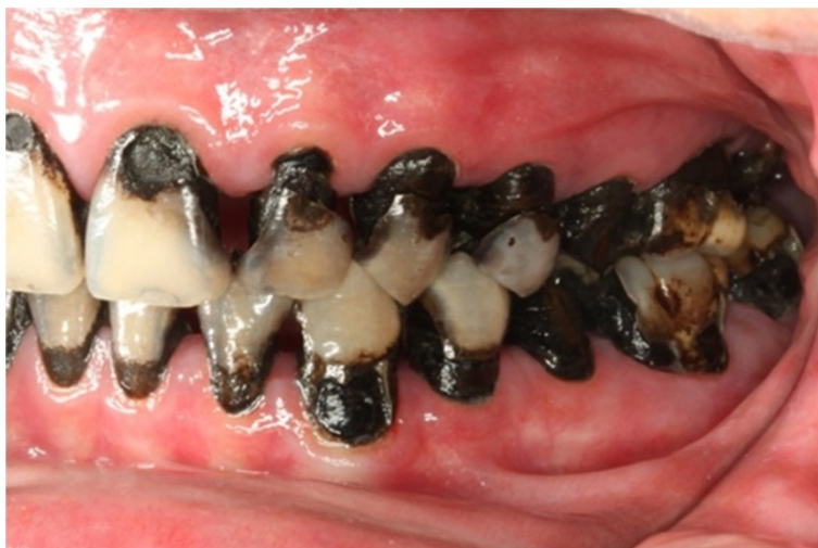
Figure 16 Right buccal view after SDF.

The upper right second premolars, the upper left canine, the two upper left premolars, and the lower right second premolars were nonresponsive to pulp vitality tests (EPT test). The patient was referred to an endodontist for root canal treatment on his nonvital teeth. The polycarbonate crowns were carefully removed and an access cavity was made through the glass ionomer (Ketac Molar) core. One-visit root canal therapy was