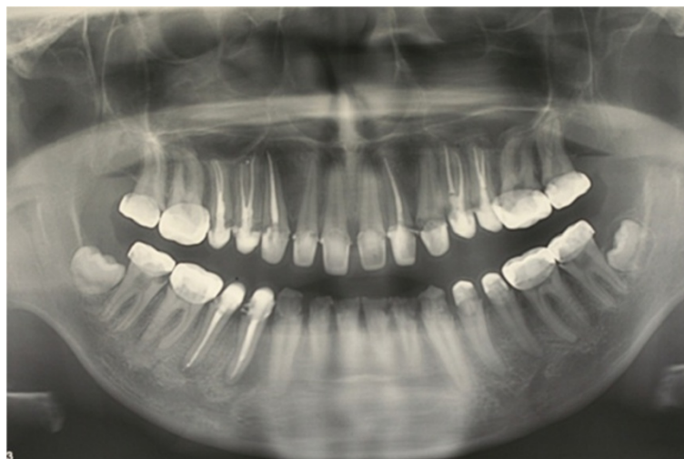
Figure 23 Post-endodontic treatment panoramic radiograph.

noteworthy that SDF is not yet cleared by the FDA for use in dentistry in the U.S. Some dentists in the U.S. suggest using 25% silver nitrate solution followed by 5% sodium fluoride varnish to arrest caries in children [22].