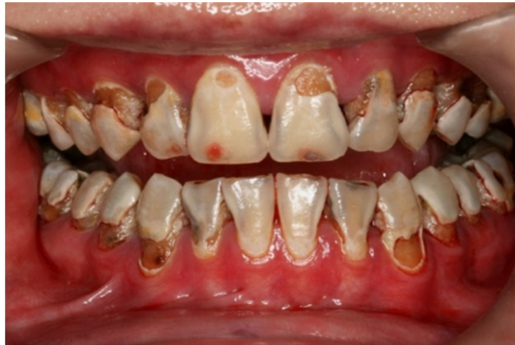
Figure 5 Pre-treatment intra-oral frontal view.

in children with neglected oral care, frequent sugar or syrup medicine intake, individuals with decreased salivary flow, and those with poor oral hygiene and drug addiction. Tooth surfaces that are ordinarily relatively caries-free are often affected. Despite the advances in dental treatment and prevention techniques, patients with rampant caries are very challenging to manage and the prognosis is not often satisfactory.