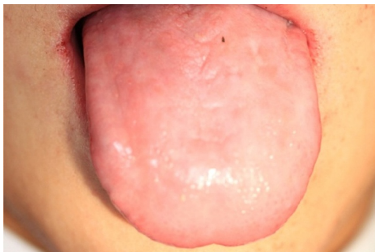
Figure 4 Depapillation of the tongue.

Rampant caries refers to advanced and severe dental disease that affects multiple teeth [3], and is typically seen