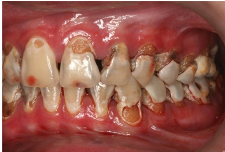
Figure 9 Pre-treatment right buccal view.

His tooth brushing, if any, was very unsatisfactory because it was painful. His doctor prescribed chlorhexidine for mouth rinsing. However, he could not use it because of its burning sensation. Due to poor oral condition, the child was emaciated, weak, and fatigued. He did not have any regular dental care or visits for more than three years.