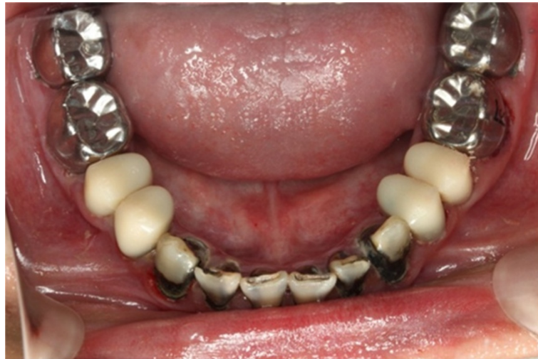
Figure 19 Lower occlusal view after provisional crowns treatment.

severe dry eyes and seemingly dry mouth resulting in multiple dental and oral conditions. However, the resting and stimulated salivary flow rates were not significantly affected. He was encouraged to take chewing gum frequently to remineralize the carious lesions, lubricate the oral cavity, and minimize potential unfavorable taste alternations.