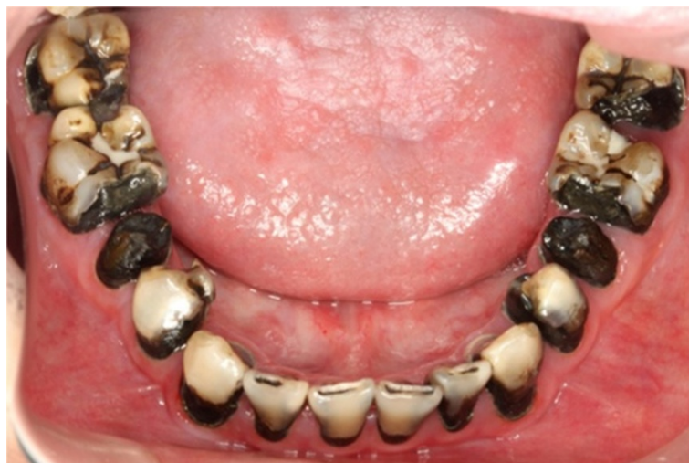
Figure 14 Lower occlusal view after SDF treatment.

A follow-up visit was carried out four weeks afterward. The child reported no tooth hypersensitivity. Caries were found arrested and turned coal black in appearance (Figure 12). Some unsupported enamel chipped off from his teeth without any dental procedure. All of the enamel of the upper and lower-left second premolars, and two lower right premolars, was no longer existent, leaving a smooth, hardened, black dentine core behind (Figures 13, 14, 15 and 16). The oral hygiene of the patient was significantly improved and following gingival response was