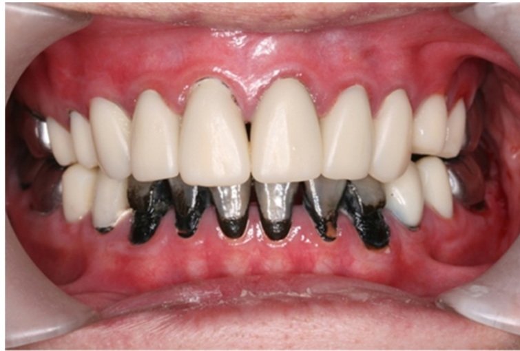
Figure 17 Frontal view after provisional crowns treatment.

performed and the crowns were recemented on the endodontically treated teeth (Figure 23).