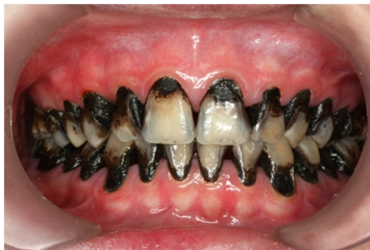
Figure 12 Front view after SDF treatment.

Tailored oral-health education was provided to the patient. To motivate the patient, the dentist decided to review his habits thoroughly, a diet analysis was performed, and he was advised to take less cariogenic nutritive foods such as rice porridge with minced pork. The patient found