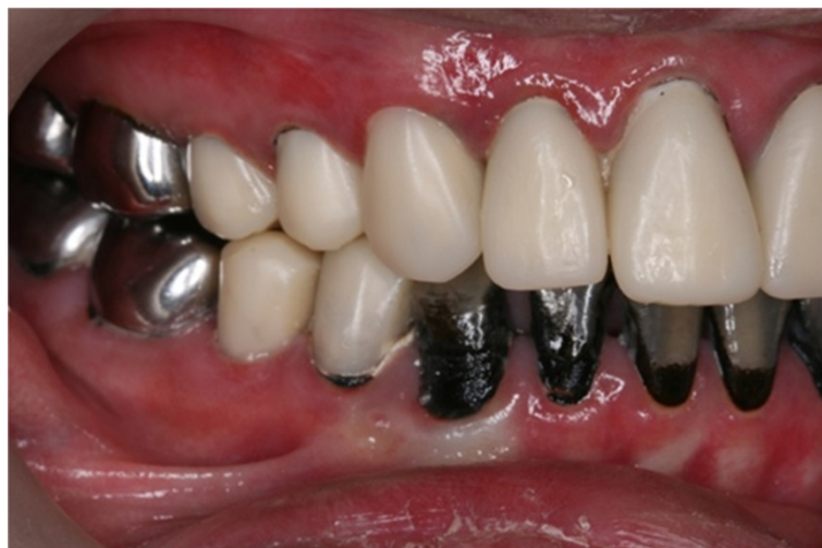
Figure 20 Left buccal view after provisional crowns treatment.

Despite the advances in clinical dentistry, rampant caries are still a challenging disease for a clinician to manage. This clinical case report demonstrated success