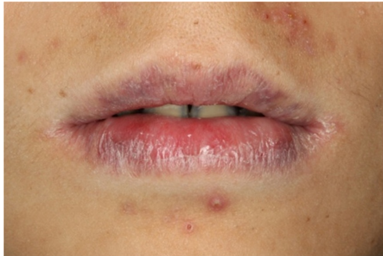
Figure 3 Bruising of the lips.

or chronic from [2]. Acute GVHD is characterized by selective damage to the liver, skin, mucosa, and the gastrointestinal tract. Chronic GVHD also attacks the above organs, but it can also cause damage to other tissue and organs. Diagnosis and treatment of chronic graft-versus-host disease (GvHD) can be difficult and there are no UK guidelines on the diagnosis and management of chronic GvHD [2]. Chronic GvHD was traditionally defined as occurring more than 100 days after transplant [2]. The National Institutes of Health consensus conference proposed 2 subcategories for chronic GvHD, classic and overlap syndrome, based on clinical features rather than time of onset [2]. This proposal recognized that classical features of chronic GvHD could occur within