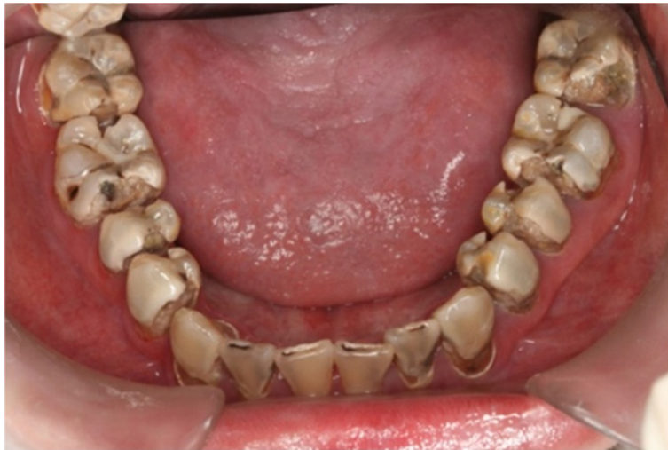
Figure 7 Pre-treatment lower occlusal view.

treatment protocol is simple and is well accepted by young children [6]. As the treatment is noninvasive, the risk of spreading the infection is very low. Literature reviews concluded that silver diamine fluoride is simple, cost-effective, safe, and efficient with “equitable” agents for caries management [6,10]. Rosenblatt et al. [10] concluded that SDF is a caries control agent that can be used to help meet the World Health Organization Millennium Goals and fulfill the U.S. Institute of Medicine’s criteria for 21st century medical care. Milgrom and Chi [11] advocated that SDF therapy is an important prevention strategy. This paper describes the use of SDF to treat rampant caries in a young teenager suffering from major \beta -thalassemia and subsequently developing