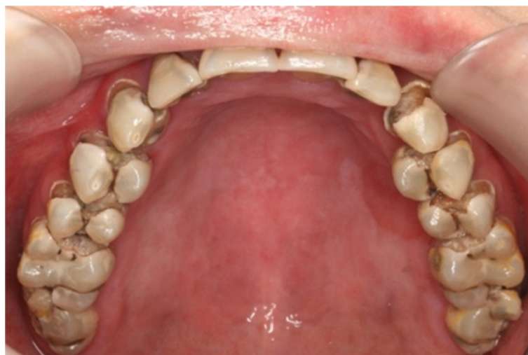
Figure 6 Pre-treatment upper occlusal view.

SDF is topically applied on the cleaned and dried caries lesions by dental professionals using a microbrush. Removal of the soft carious before the SDF application is not necessary because such caries removal would not significantly affect the caries-arresting rate [8]. This