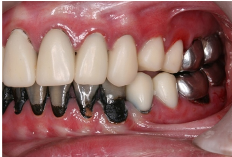
Figure 21 Right buccal view after provisional crowns treatment.

at controlling rampant caries of a young teenager with SDF. Oral-health education was delivered through motivational interviewing, facilitating and engaging intrinsic motivation in order to change patient behavior [15]. Motivational interviewing is a patient-centered, purpose-oriented counseling, and it is more focused and goal-directed than nondirective counseling. By helping the child patient to explore and resolve ambivalence, and showing that the goal set is achievable, the child was motivated to change his behavior and improve his oral health.