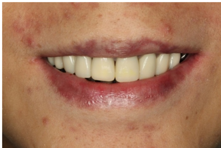
Figure 22 Smile photo after provisional crowns treatment.

dentine [19]. Clinical studies found that SDF can prevent and arrest coronal and root caries [7,20]. SDF is also used to manage dentine hypersensitivity [21]. Rosenblatt and associates [10] performed a review on SDF and concluded that it is a safe, effective, efficient, and "equitable" caries-control agent that can be used to meet the World Health Organization Millennium Goals and fulfil the U.S. Institute of Medicine's criteria for 21st century medical care. Milgrom and Chi [11] advocated that SDF therapy is an important prevention-centred caries management strategy during critical periods in early childhood. The use of silver diamine fluoride in clinical dentistry has been reported in countries in Asia, Australia, and South America such as Brazil, China, Cuba and Japan [6]. However, it is