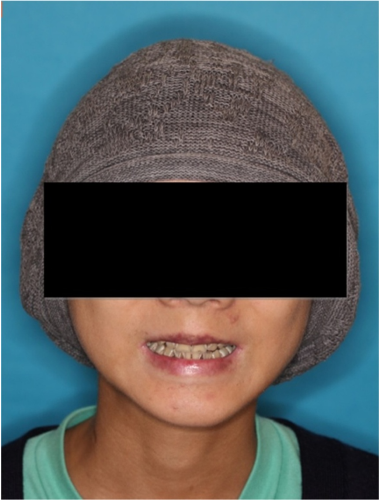
Figure 1 Full face photo.