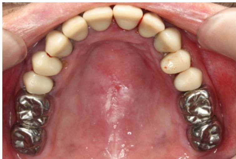
Figure 18 Upper occlusal view after provisional crowns treatment.

Due to the breakage of the oral mucosal barrier, and the use of potent systemic and topical immunosuppressants, opportunistic infection caused by bacteria, viruses, or fungus are common. This also aggravates the poor oral hygiene and dental caries development. The worst outcome is the development of oral cancer, which has been well documented. Since the original description by Izutse and associates [13], Sjogren's like syndrome in patients with GVHD, presumably caused by salivary and ocular lymphocytic infiltrations, have been reported in many clinical studies [14]. This child patient presented