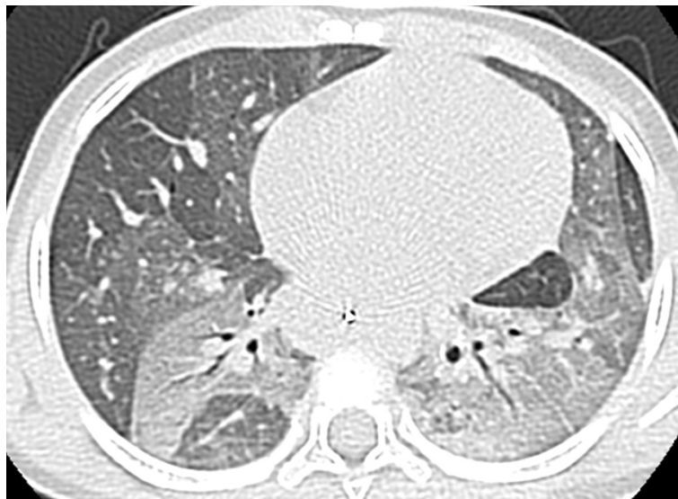
Figure 1 Chest computerized tomography scan showing diffuse ground-glass opacities with air-bronchograms in the upper lobes and the left lower lobe.

Desquamative interstitial pneumonia (DIP) is the most frequently described histologic diagnosis amongst