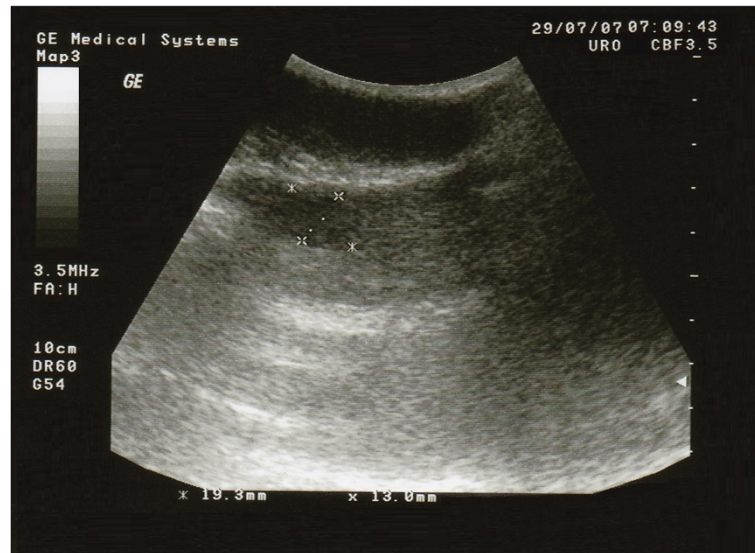
Figure 1 Ultrasound of a right testis with Leydig cell tumor. The tumor appears as a hypoechoic non-homogeneous mass within the testicular parenchyma.

successfully fathered a child. Over these two years the patient overgrowth 30 kilos (at initial examination weight 90 kilos/height 195 cm). On physical examination the testicular tumor mass has not changed in size and scrotal ultrasonography had the same aspect, but gynecomastia was present. The tumor markers (AFP and \beta -hCG) were also negative and hormonal investigations were normal, except moderately elevated estradiol level (E2) and low normal level of testosterone (T) (Table 1). This time the patient accepted surgery. With a diagnosis of right testicular tumor, radical right high orchiectomy was performed and the specimen has been submitted for histopathological examination. The final diagnosis of benign Leydig cell tumor of testis was given (Figure 2). Immunohistochemical profile