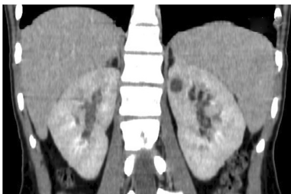
Figure 3 Coronal multiplanar reconstruction (MPR) of the abdominal CT scan revealed a hypodense lesion in the upper pole of the left kidney.

On the basis of the radiological findings, miliary TB was suspected and bronchoscopy was performed together with a bronchoalveolar lavage (BAL) in order to search for Mt by means of polymerase chain reaction (real-time PCR, Cobas TaqMan MTB PCR system) and culture. A urine sample was also tested for the same reason. Both cultures were positive, whereas PCR identified Mt only in the BAL fluid. Miliary TB was confirmed and treatment with four drugs was started in accordance with the WHO guidelines (isoniazid 10 mg/kg/day, rifampicin 15 mg/kg/day, ethambutol 20 mg/kg/day, and pyrazinamide 35 mg/kg/daily) [6]. The therapy was rapidly effective as the fever disappeared within a few days, the abdominal problems resolved, and the patient's general condition improved together with a gain in body