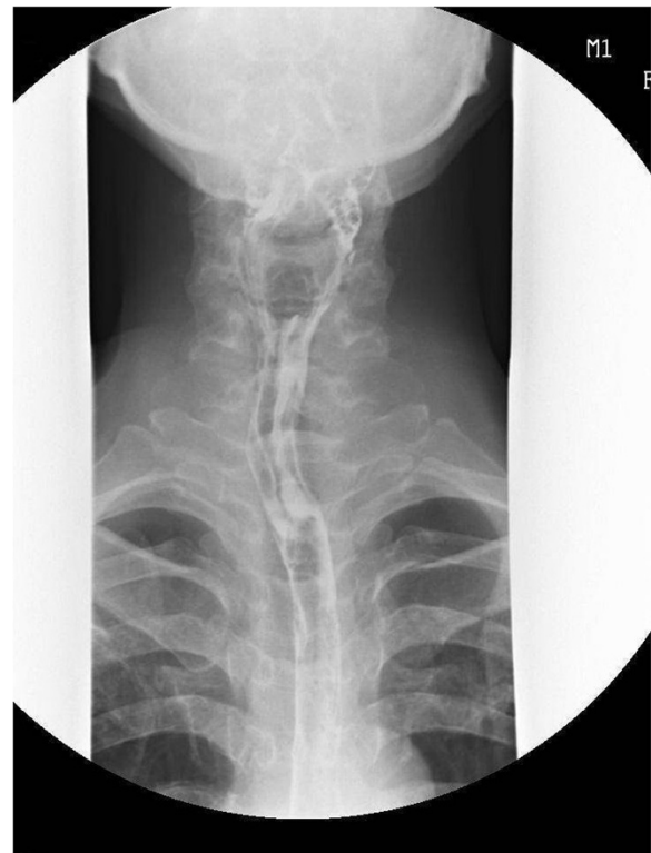
Figure 7 Normal findings were observed on an esophagogram performed on the 10 th postoperative day.

A toothbrush is a commonly used object in one's daily life, but visiting the emergency room because of swallowing a toothbrush is rare; such a case may rarely occur in patients with mental retardation or a history of psychological disorders. Unlike a typical small foreign body, a toothbrush rarely passes through the gastrointestinal