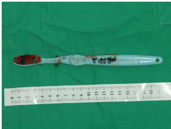
Figure 5 The removed toothbrush after the surgery. Total length is approximately 20 cm.