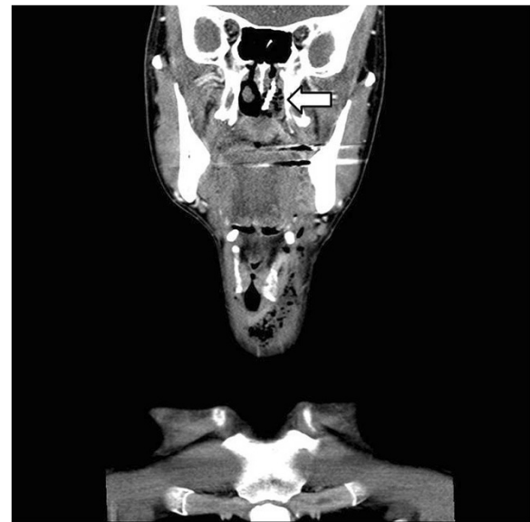
Figure 3 Coronal view of same CT. (Arrow) A neck CT shows the toothbrush spanning the nasopharynx and oropharynx, as well as subcutaneous emphysema in the anterior and lateral cervical regions.

To evaluate hypopharyngeal and esophageal damage, an esophagogram was obtained using a water-soluble contrast dye on the first postoperative day, and a small perforation in the hypopharyngeal region was identified. Accordingly, the patient received conservative therapy, including intravenous broad-range antibiotic administration and was placed on oral dietary restrictions. No specific findings or complications were detected via the esophagogram on the 10 th postoperative day, and the patient was subsequently discharged and is currently being followed up (Figures 6 and 7).