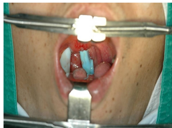
Figure 4 At the oropharynx, part of the toothbrush handle is observed.

To evaluate hypopharyngeal and esophageal damage, an esophagogram was obtained using a water-soluble contrast dye on the first postoperative day, and a small perforation in the hypopharyngeal region was identified. Accordingly, the patient received conservative therapy, including intravenous broad-range antibiotic administration and was placed on oral dietary restrictions. No specific findings or complications were detected via the esophagogram on the 10 th postoperative day, and the patient was subsequently discharged and is currently being followed up (Figures 6 and 7).