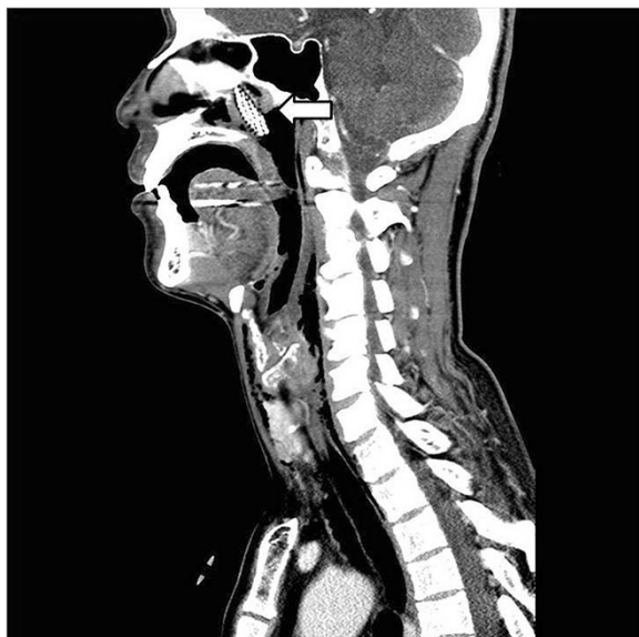
Figure 2 Sagittal view of neck CT scan. (Arrow) A neck CT shows the toothbrush spanning the nasopharynx and oropharynx, as well as subcutaneous emphysema in the anterior and lateral cervical regions.

An intraoral approach employing nasotracheal tube insertion under general anesthesia was used. The exposed part of the toothbrush was cut with an electric surgical saw. Following the removal of the two separate parts, the uvular laceration was sutured and the surgery was completed (Figures 4 and 5).