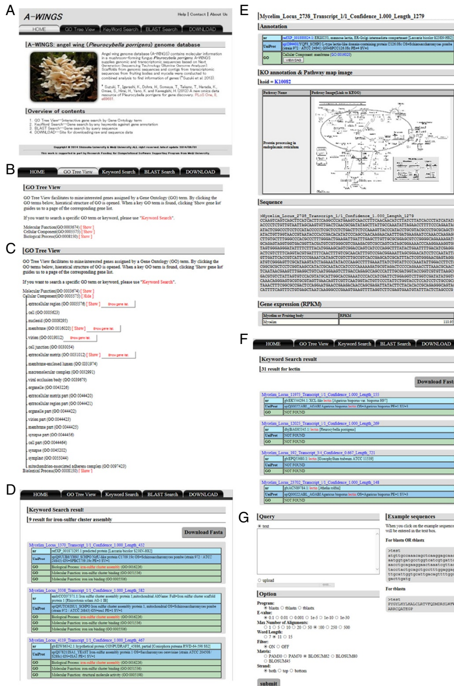
Figure 2 Graphical user interfaces of A-WINGS: (A) top (parent) page; (B) GO Tree View page; (C) GO Tree View page with 'child' GO terms; (D) the gene list associated with a GO term; (E) the detailed page for unigene (transcript information); (F) search results obtained by the keyword search function; (G) the BLAST search interface.

properly selected. The functional annotations obtained from three databases (nr, UniProt and GO terms) are employed by the default search function. Users can select the database (nr, UniProt and GO terms) to use for the search. As in the 'GO Tree View' described above, search results are shown on a gene list page with the