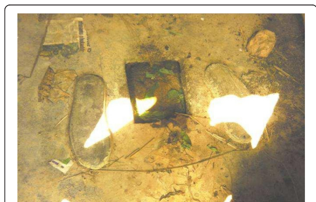
Figure 2 To show that majority of island latrines were full and dirty and thus not convenient for use.

Intersectoral collaboration [23] between health and fisheries department could be play a major role in improving the treatment coverage. Most of the migratory