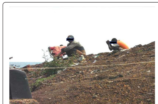
Figure 3 To show that most people in Islands practiced open air defaecation (Taken using a zoom camera).