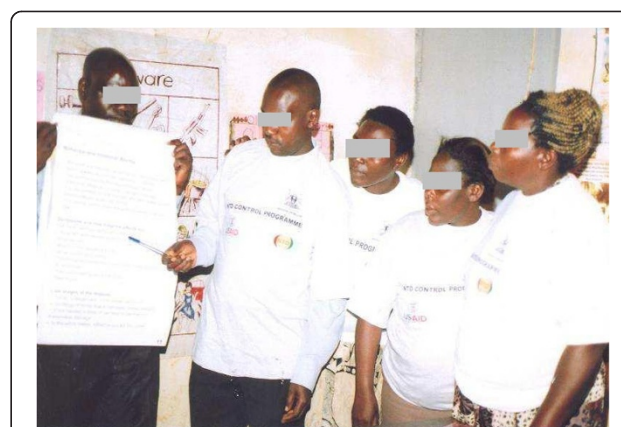
Figure 4 To show that those Drug Distributors who were trained were each offered a T-shirt by RTI- ENVISION.

Data from this study has indicated that awareness and knowledge about schistosomiasis is low even among biomedical health staff and many negative misconceptions exist especially in regard to disease transmission and prevention. Most people including biomedical staff do