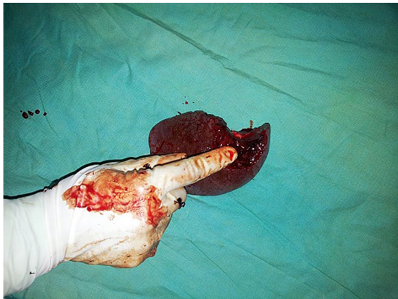
Figure 2 Post-splenectomy—splenic laceration close to upper pole.

spontaneous splenic rupture occurred during the acute stage of the illness, either during the viraemic stage or the critical phase (Table 1). There have been no previously documented cases of this manifestation occurring in the recovery phase of the illness. It is hypothesized that a combination of coagulation factors and severe thrombocytopenia lead to this phenomenon, however the exact mechanism of splenic rupture in dengue is not clear. The fact that this occurred in our patient during the recovery phase, where the platelet count was rising and normal coagulation profile, contradicts both theories. The splenic histology of our patient was also unremarkable rejecting any structural damage to the spleen leading to rupture. A possible mechanism which could be postulated is severe splenic congestion leading to laceration and subcapsular hematoma formation. Timely diagnosis and intervention lead to complete recovery of our patient, which is fortunate compared to most other reported cases which had a fatal outcome [11].