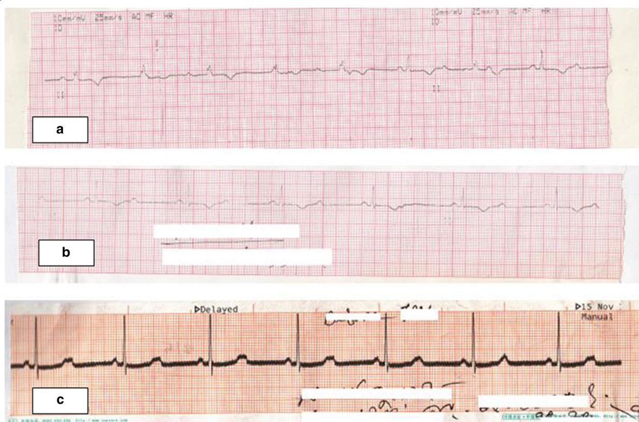
Fig. 1 ECG tracing during initial presentation showing different arrhythmias. a Complete heart block, b 2:1 Atrio-ventricular block, c Sinus bradycardia

Seven weeks after pacemaker implantation, she presented again with recurrent episodes of syncope. She had eight episodes of syncope in the 3 days prior to presentation, each lasting less than fifteen seconds, following which she regained consciousness. The ECG showed complete heart block with pacemaker spikes and failure