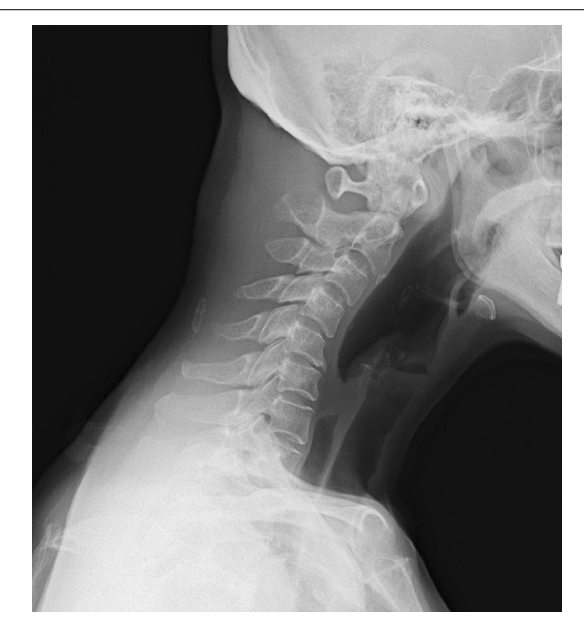
Fig. 2 Lateral radiograph of cervical spine in a neutral position. Plain radiography shows severe cervical kyphosis at the patient's first visit to our department