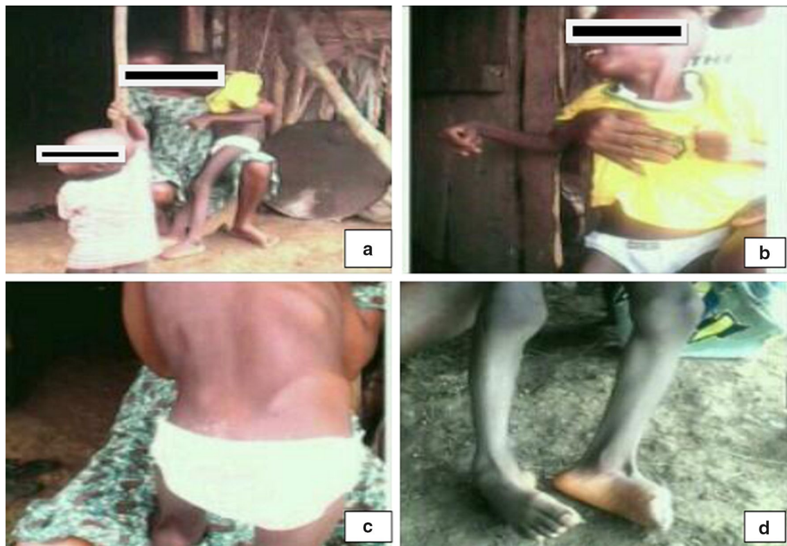
Fig. 1 a Poor socio-economic condition of the community. b Muscle wasting and contracture of the elbow joint. c Wasting of the back and gluteal muscles, swaying of the hip. d Wasting of calf muscles and deformity of the ankle

On physical examination, the patient was conscious, afebrile, with no facial dimorphic features. Pupillary size and reflexes were normal. There was no ptosis or facial weakness. There was wasting of the upper limb, scapular, and spinal muscles and contractures of the elbows and ankles (Fig. 1c). There was no calf hypertrophy/pseudohypertrophy. Muscle power was 4/5 on both upper and lower limbs. There was weakness of the cervical, lumbar and pelvic muscles, evident by poor head control and swaying movements of the waist respectively. Hypertonia was evident on the muscles of the arm and calf, with