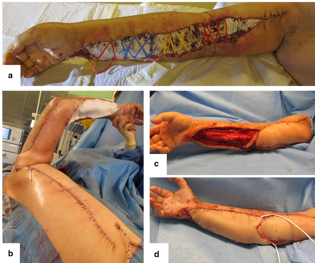
Fig. 1 Soft tissue defect reconstruction applying dermatotraction ( a ), a pedicled, fasciocutaneous parascapular flap ( b, c ), and an ipsilateral antero-lateral thigh flap (lateral circumflexing femoral artery perforator flap) ( d )

myositis, respectively [2]. The increasing number of severe toxic streptococcal infections over the last 20 years has coincided with an increased prevalence of certain M protein serotypes, such as M1 and M3; and an increase in the number of GAS strains producing streptococcal pyrogenic exotoxin A and protease [10, 11].