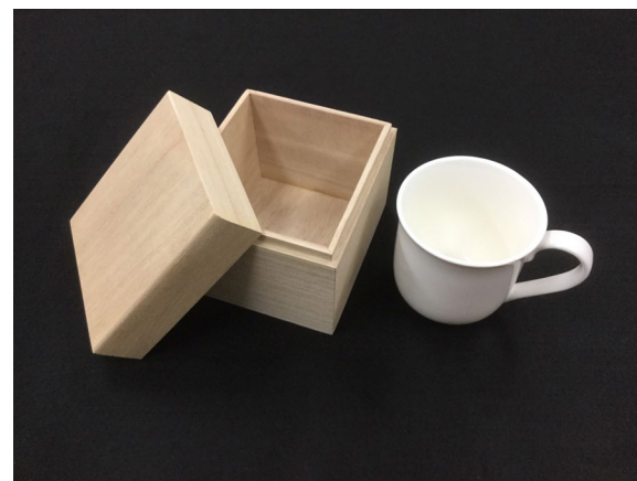
Fig. 1 The cup and wooden box used in the experiment

Helping task The Chinese experimenter asked the participants to take part in extra tasks (3 min each) for his own study. He noted that it would be beneficial if the participants could take part in as many tasks as possible for