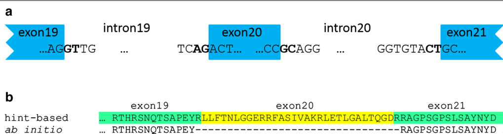
Fig. 2 Representative gene structure of missed non-canonical splice sites in ab initio gene prediction in Nd-1. Gene structure of the At1g79350 RBH in the hint-based gene prediction (GeneSet_Nd-1_v1.1) on the Nd-1 genome sequence is displayed (a). The non-canonical splice sites were missed in the ab initio gene prediction leading to a skipping of exon 20 (highlighted in yellow) (b)

Allowing an increased number of alternative splicing possibilities deviating from the GT-AG rule would render ab initio prediction of gene structures almost impossible. Since the number of non-canonical splice sites is low, the ratio of false positive predictions would strongly increase. Incorporation of evidence from RNA-Seq experiments or high quality annotations of related genome sequences