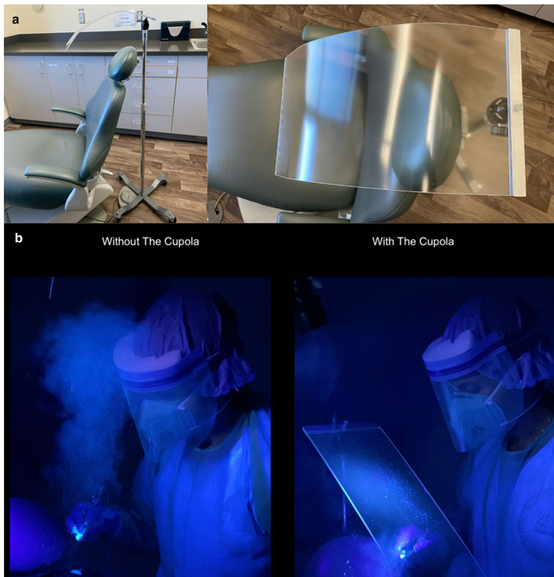
Fig. 1 a The Cupola—protective shield. b Simulated dental procedure using a high-speed handpiece without and with The Cupola

We hypothesized that the use of The Cupola during aerosol generating procedures in the oropharyngeal region decreases the spread of droplets and aerosols in dental offices, which could lead to safer dental practices. This has potential implications to decrease the spread of disease among dentists, maxillofacial surgeons, otolaryngologists and their patients. The aim of this pilot study is to assess the efficacy of The Cupola in decreasing the spread of droplets and aerosols during simulated aerosol generating dental procedures.